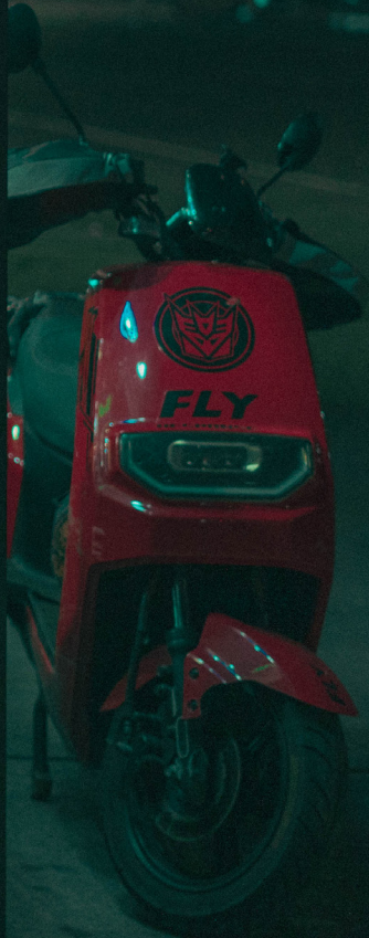
NYC Night (Naseem Nasser Alansari)