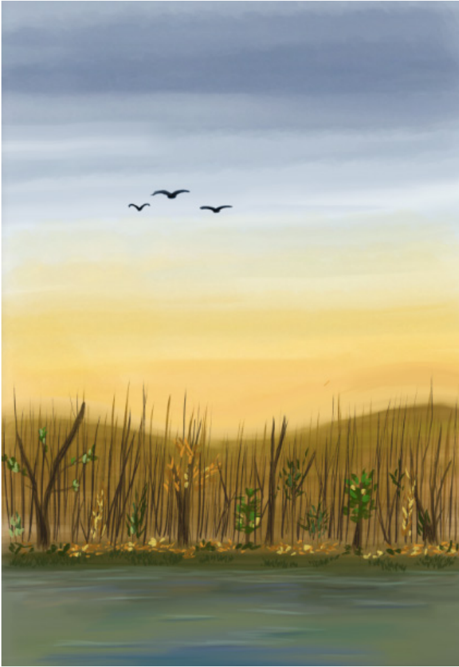
Flying away (Alexandria Pinkston)