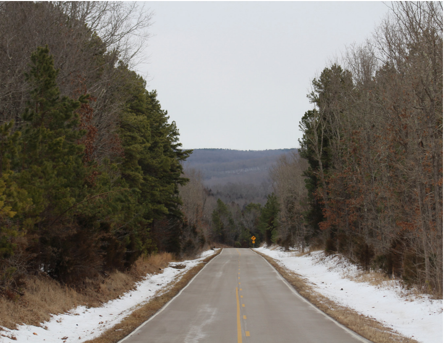
Road to Somewhere (Landon Royster)