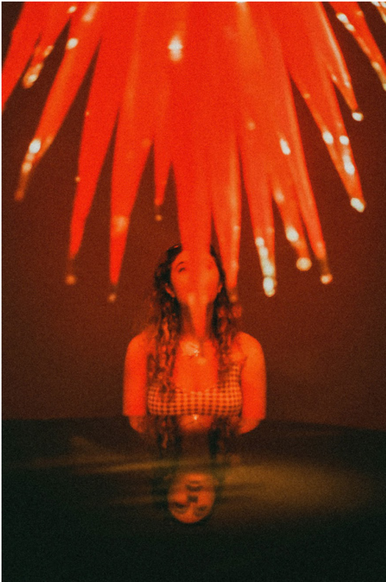
PermaRed.