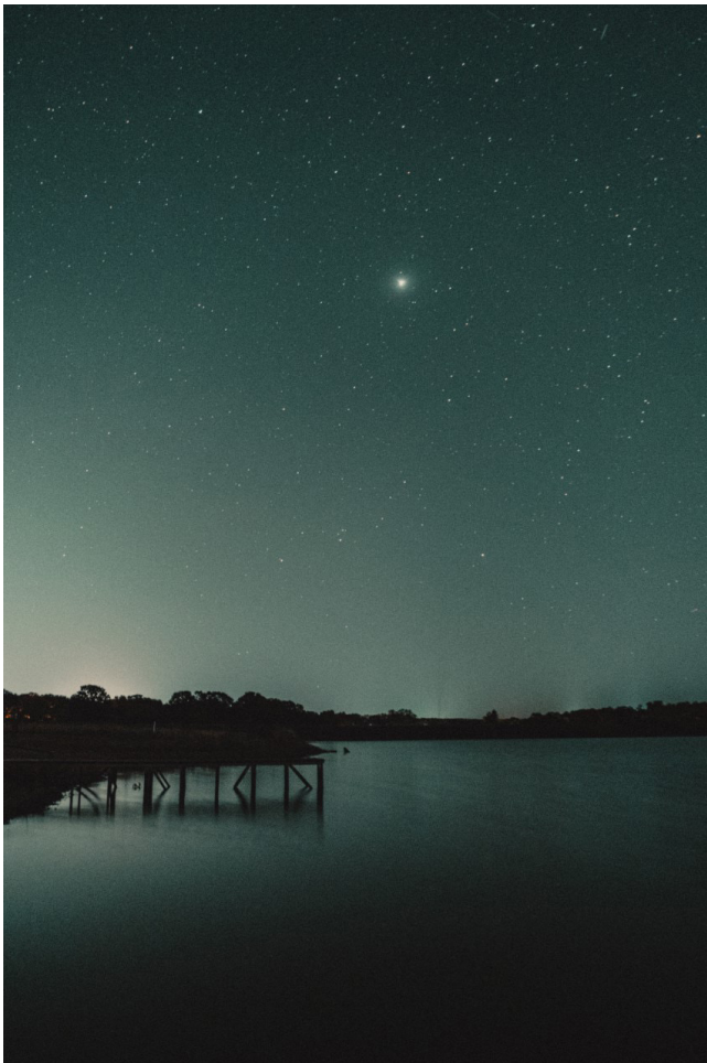
A Cold Night