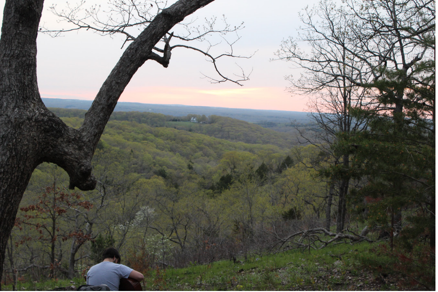
Hobby Writing (Parker Buckson)