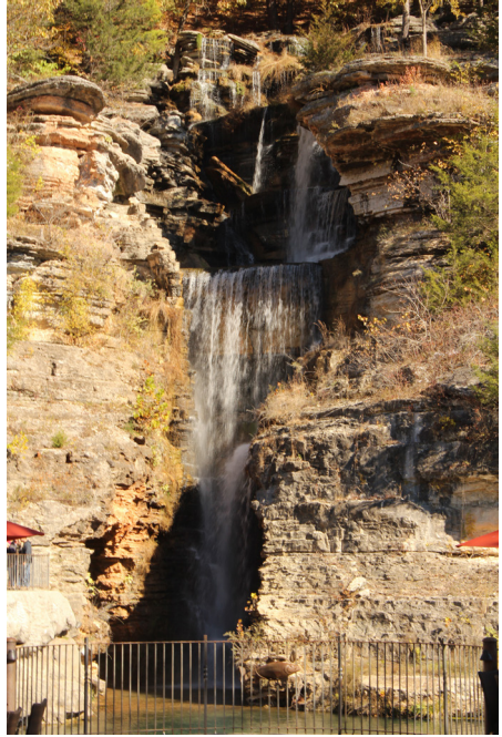
Mystery Falls (Landon Royster)