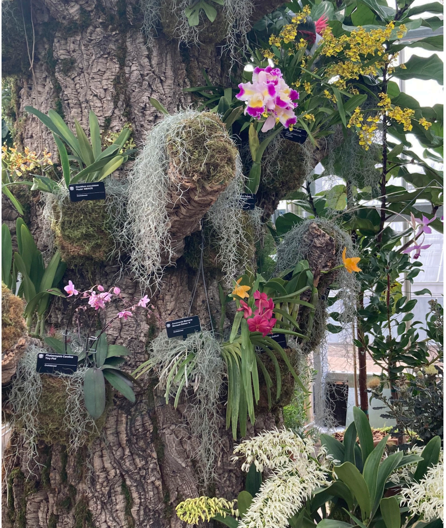
Orchids 1 (Cindy Wilson)