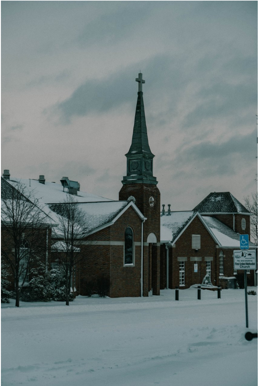
First United Methodist Church (Andreas Ellinas)