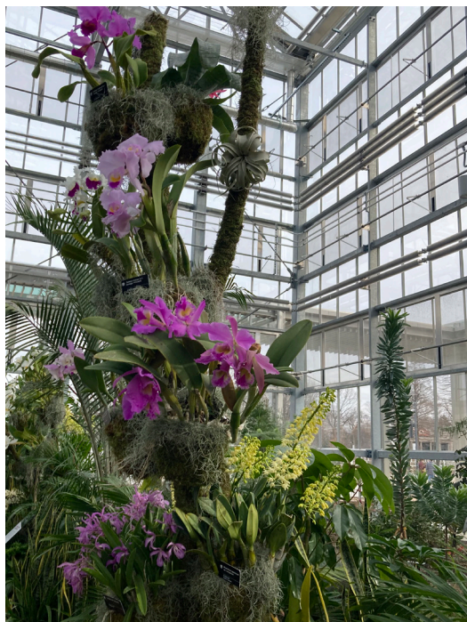
Orchids 4 (Cindy Wilson)