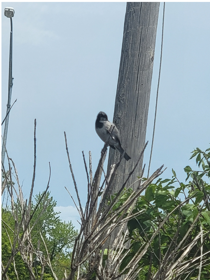
Stationary, For Now (Nate Opperman)