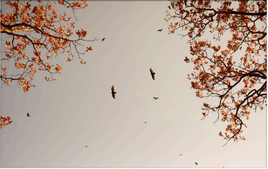
Surrounded (Kassandra Hayes)