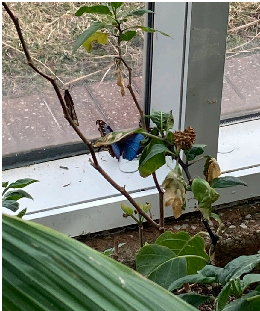
Orchids 2 (Cindy Wilson)